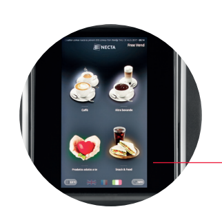
Up to 4 customizable product category, depending on location.